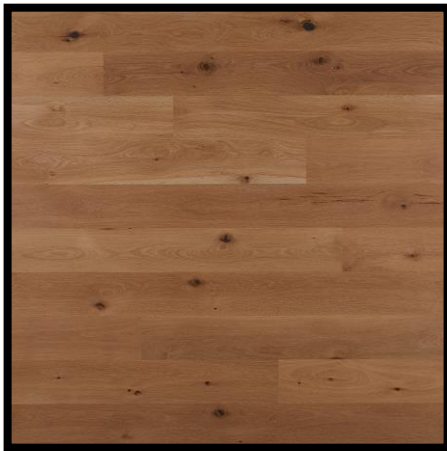
Light Rustic Grade